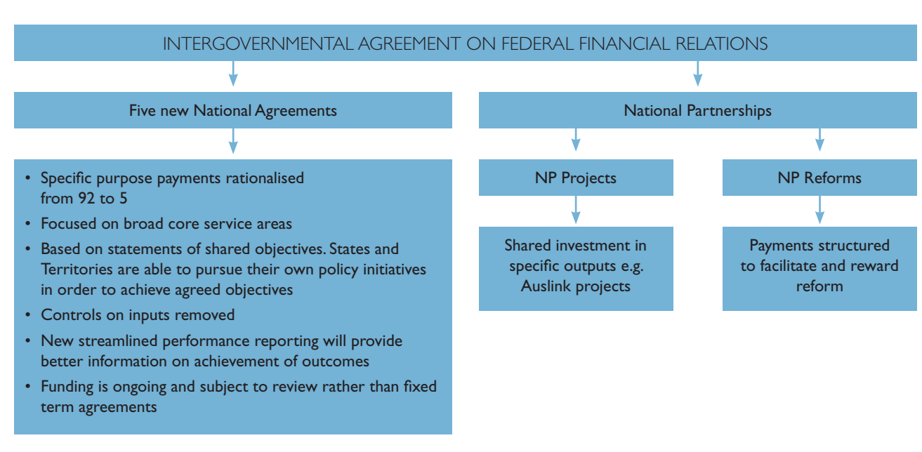
FIGURE 1: INTERGOVERNMENTAL AGREEMENT ON FEDERAL FINANCIAL RELATIONS

This ambitious new reform agenda represents a significant step forward in cooperative federalism. Nevertheless, there is still considerable room for further improvement and reform to harness the benefits of Australia's federal system.